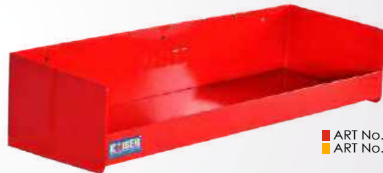
■ ART No. 536105 ■ ART No. 536106