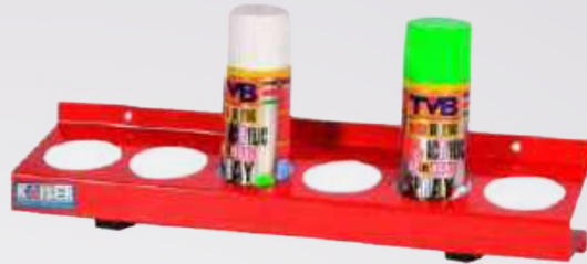
■ ART No. 536101 ■ ART No. 536102