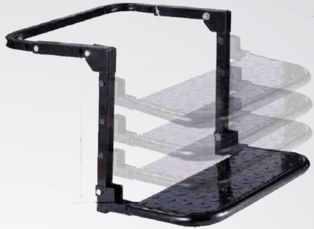
■ ART No. 536133