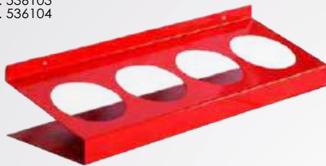
■ ART No. 536103 ■ ART No. 536104