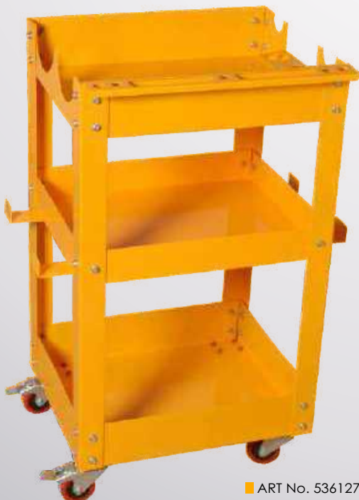
■ ART No. 536127